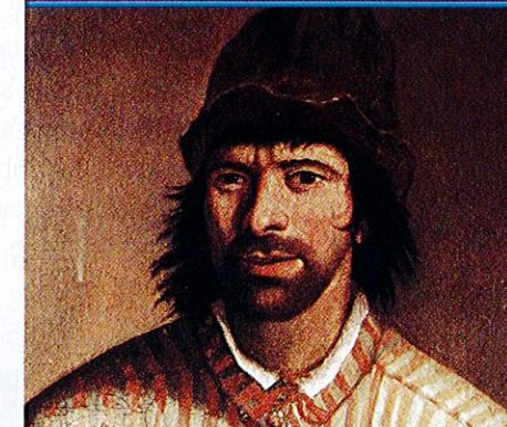
Peter the Great 1672–1725

Peter the Great had the mind of a genius, the body of a giant, and the ferocious temper of a bear. He was so strong that he was known to take a heavy silver plate and roll it up as if it were a piece of paper. If someone annoyed him, he would knock the offender unconscious.