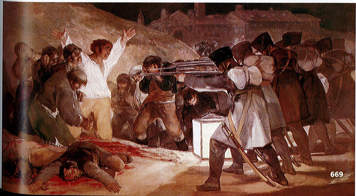
▼ Francisco Goya's painting The Third of May, 1808 shows a French firing squad executing Spanish peasants suspected of being guerrillas.

Recognizing Effects A How could the growing feelings of nationalism in European countries hurt Napoleon?