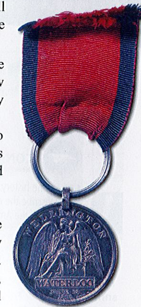
▲ British soldiers who fought at the battle of Waterloo received this medal.

Without doubt, Napoleon was a military genius and a brilliant administrator. Yet all his victories and other achievements must be measured against the millions of lives that were lost in his wars. The French writer Alexis de Tocqueville summed up Napoleon's character by saying, "He was as great as a man can be without virtue." Napoleon's defeat opened the door for the freed European countries to establish a new order.