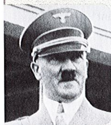
Adolf Hitler 1889–1945

Vowing to lead Italy “back to her ways of ancient greatness,” Mussolini peppered his speeches with aggressive words such as war and power .