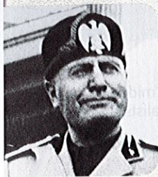
Benito Mussolini 1883–1945

Because Mussolini was of modest height, he usually chose a location for his speeches where he towered above the crowds—often a balcony high above a public square. He then roused audiences with his emotional speeches and theatrical gestures and body movements.