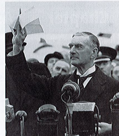
▲ Chamberlain waves the statement he read following the Munich Conference.

When Chamberlain returned to London, he told cheering crowds, "I believe it is peace for our time." Winston Churchill, then a member of the British Parliament, strongly disagreed. He opposed the appeasement policy and gloomily warned of its consequences: