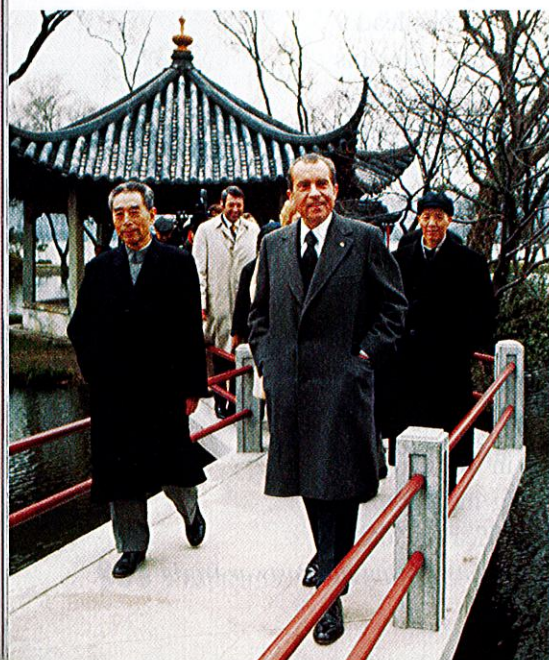
▼ U.S. president Nixon visits China in 1972, accompanied by Chinese premier Zhou Enlai (left).