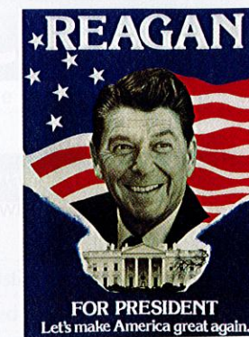
▲ Ronald Reagan's 1980 political button highlights the strong patriotic theme of his campaign.

Tensions increased as U.S. activities such as arming Nicaragua's Contras pushed the United States and Soviet Union further from détente. However, a change in Soviet leadership in 1985 brought a new policy toward the United States and the beginnings of a final thaw in the Cold War. Meanwhile, as you will learn in the next chapter, developing countries continued their own struggles for independence.