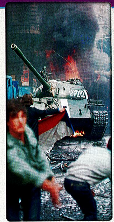
▲ Czech demonstrators fight Soviet tanks in 1968.

In 1989, after Communists lost control of Hungary's government, Nagy was reburied with official honors.