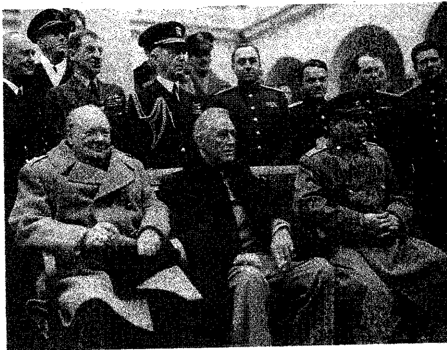
"The Big Three"—Churchill, Roosevelt, and Stalin—meeting at Yalta, 1945